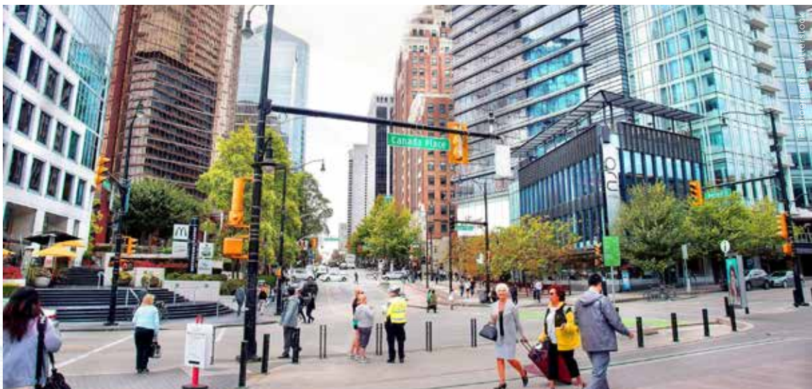
‘100% RE Talks’ encouraged people to ask questions about the Renewable City Strategy

‘100% RE Talks’ encouraged groups of ten or more people to fill out an online form and made city sustainability staff available for one to two hour meetings during which they would answer questions about the Renewable City Strategy and what it will mean for buildings, transportation and day-to-day life in the city.