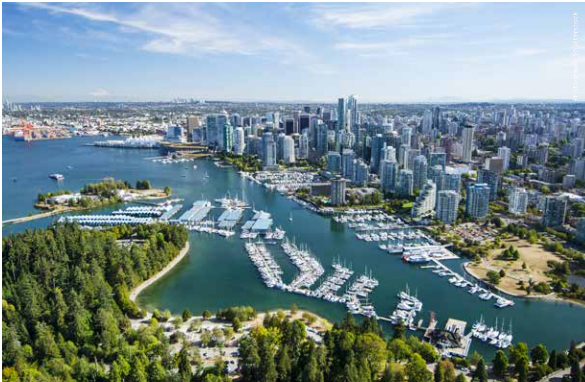
Retrofitting buildings will reduce heating and cooling needs

Strategic partnerships are key to achieving a city-wide 100% renewable energy goal. The city has control over its own building stock and can influence other structures through building standards. It also has control over land use, bio-methane gas capture and road network planning. However, it needs to collaborate with other governmental authorities in the region on major public transportation improvements and waste management. The city will also need to coordinate with provincial and federal governments on various other issues where its own regulatory and policy-making authority is limited, including power generation and distribution, carbon pricing, vehicle efficiency and pollution standards.